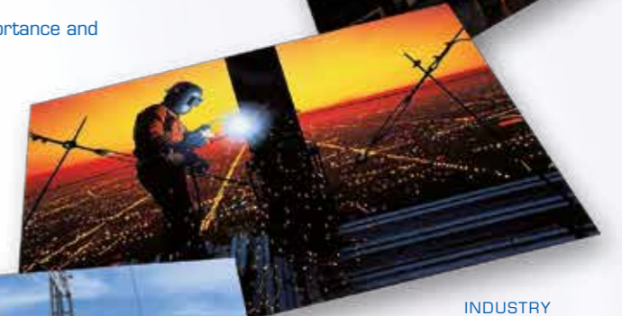
INDUSTRY AND UTILITIES