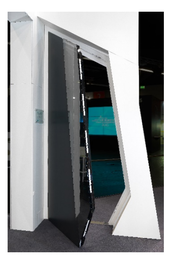
Bd_MACO_Form_Freedom: The innovative locking system enables new door designs and flexible security standards.