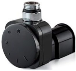
> Masking cable