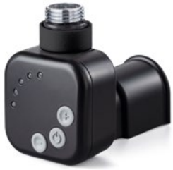
> Masking cable