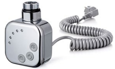
> Spiral cable