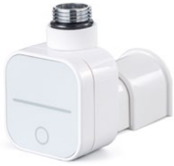
> Masking cable