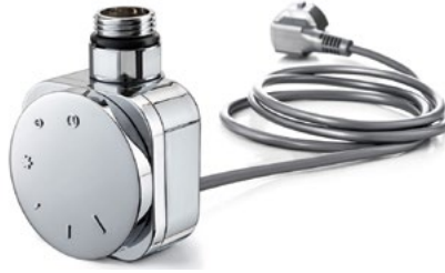
> Straight cable