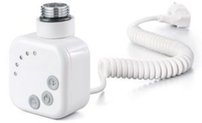
> Spiral cable