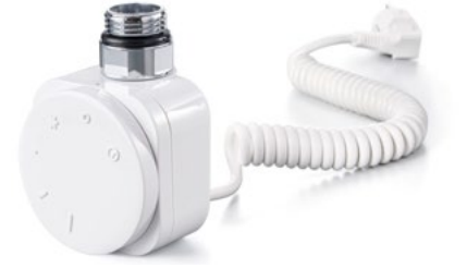
> Spiral cable