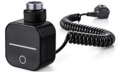
> Spiral cable