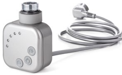
> Straight cable