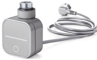
> Straight cable