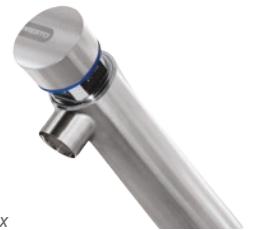
PRESTO NEO Inox

The NEO Stainless Steel is part of a comprehensive range of stainless steel washroom sanitary accessories and fittings.