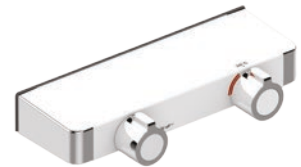
Shower tablet version