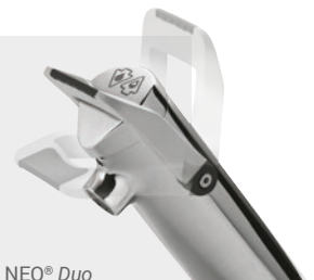
PRESTO NEO® Duo

Le PRESTO NEO® Duo is the perfect solution for companies in the service sector and for facilities with young children, the elderly or people with reduced mobility. It was recognised at the Concours de l'Innovation du Mondial du Bâtiment in 2015 (silver medal in the Bath Room category).