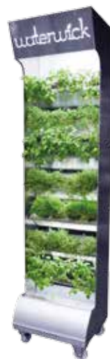
W33 - WaterWick Green Wall 60cm