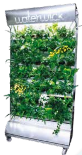
W32 - WaterWick Green Wall 120cm