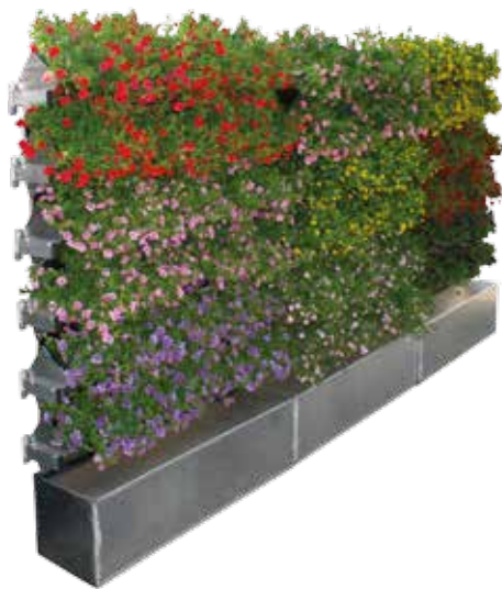
W35 - WaterWick Garden Wall 120cm