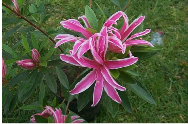
Azalea japonica 'Pink Spyder'