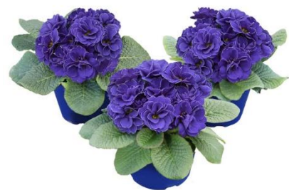
Primula acaulis 'Rubens'