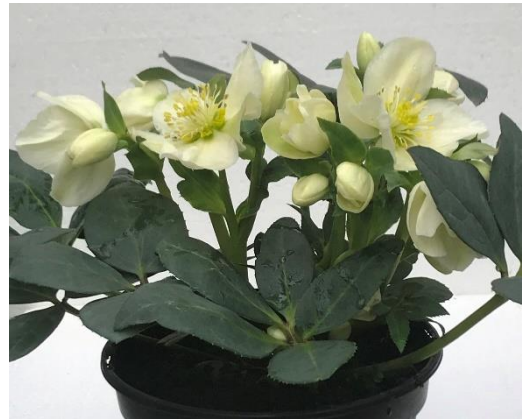
Helleborus 'Diego Ice'